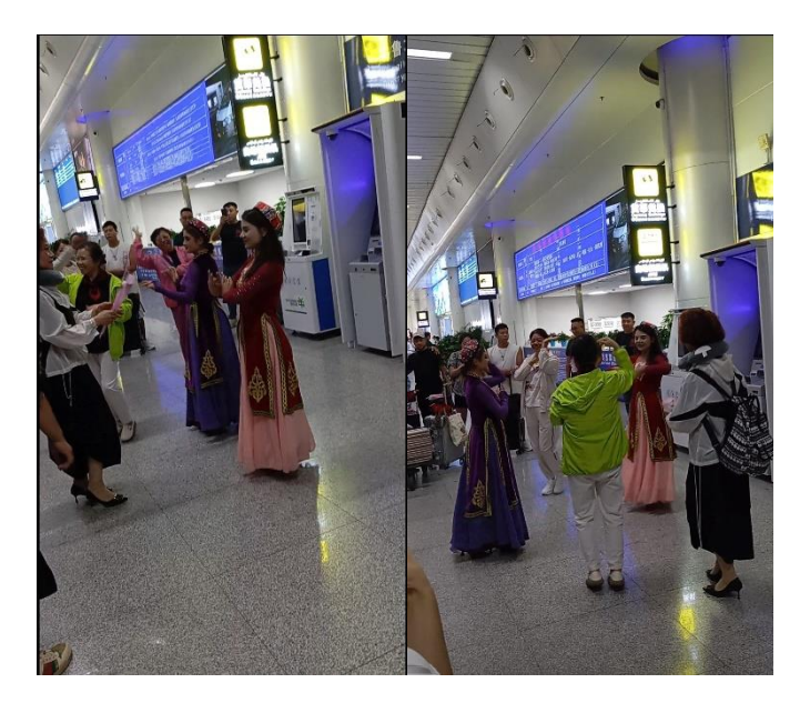
At Urumqi Airport Chinese Girls Welcoming the Traveler

Then we flew from Urumqi to Chengdu international Airport, we clamed our luggage and moved towards the fats train station. We buy our fast train ticket for Xian and travelled by a fast train, before reaching to the xian almost our cabin was empty only four to five men was with us, they were eating candies and offered us candy by knowing we are foreigner (hospitality in the train was touched my heart). I was shocked when the train was moving with speed of 244km/h and there was no turbulence in the train, even I put an empty water bottle on my window to check the train vibration.